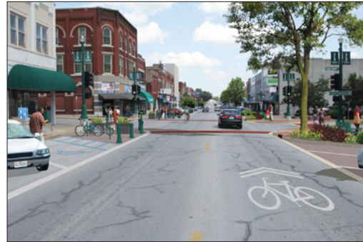
Photo by the WALC Institute / Photovision by the WALC Institute, TDC Design Studio and CoxHealth Monett