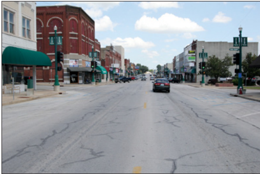
▲ MONETT, MISSOURI (the present and the possibilities)

Photo by the WALC Institute / Photovision by the WALC Institute, TDC Design Studio and CoxHealth Monett