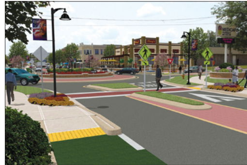
▲ DES MOINES, IOWA (the present and the possibilities)

Photo by the WALC Institute / Photovision by the WALC Institute, TDC Design Studio and AARP