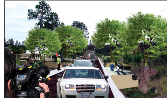
... and more Possibilities

By partnering with adjacent towns, the state government and federal agencies, the Orange Beach community has an opportunity to develop a national model for evacuation routes that are eco-friendly and support active living when not being used for an emergency evacuation.