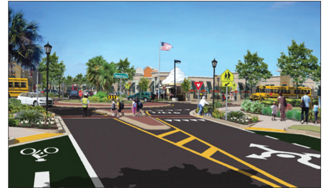
... and more Possibilities

Located in a suburban area dominated by single-family housing, this Winter Garden roadway is an important connector for kids walking and biking to school as well as for workers getting to their commuter routes. Vehicle congestion has increased as the surrounding areas have developed and commercial and retail establishments have flourished. On one corner of the intersection is a municipal baseball park. The remaining three corners are slated for commercial development. Instead of widening the roadway and intersection to allow for more vehicles at faster speeds, the community envisions a safer intersection that creates better access for everyone and attracts high-quality commercial development.