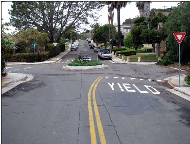
◀ SAN DIEGO, CALIFORNIA

A splitter island at the center of the roundabout (see the image at near left) helps people cross the street more safely by allowing them to cross only one direction of traffic at a time. In addition, landscaping and bicycle lanes help to inspire a revitalization of the neighborhood. Learn more by reading the Livability Fact Sheet: Modern Roundabouts at aarp.org/livability-factsheets .