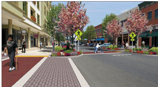
Photo by the WALC Institute / Photovision by the WALC Institute, TDC Design Studio and the Hot Springs Area Metropolitan Planning Organization